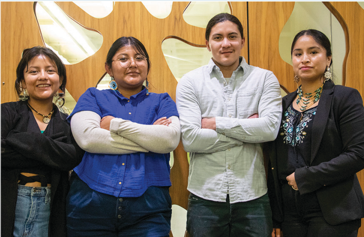
The Kichwa Collaborative Learning Team will share historical insight into the indigenous Kichwa diaspora from South America to Wisconsin.