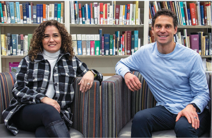
The Parent Event Team is comprised of parents whose kids attend Nuestro Mundo Community School.