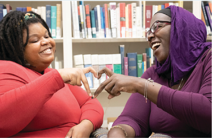
The LGBTQIA+ Social Event Team will provide a social connection experience for the Queer BIPOC community.

Started by parents whose kids attend Nuestro Mundo Community School, this group hopes to provide an opportunity for parents to gather and share knowledge, resources and tips. Parents can propose topics, such as rainy day activities, picky eaters or favorite books — but the actual topics would be up to those who attend. Following the “open space” structure, parents can move to the topics of greatest interest and then change throughout the event. This event will include bilingual discussion groups in English and Spanish. This team is focused on getting parents and caregivers together in a way that is inclusive and community-building for other elementary school-aged families.