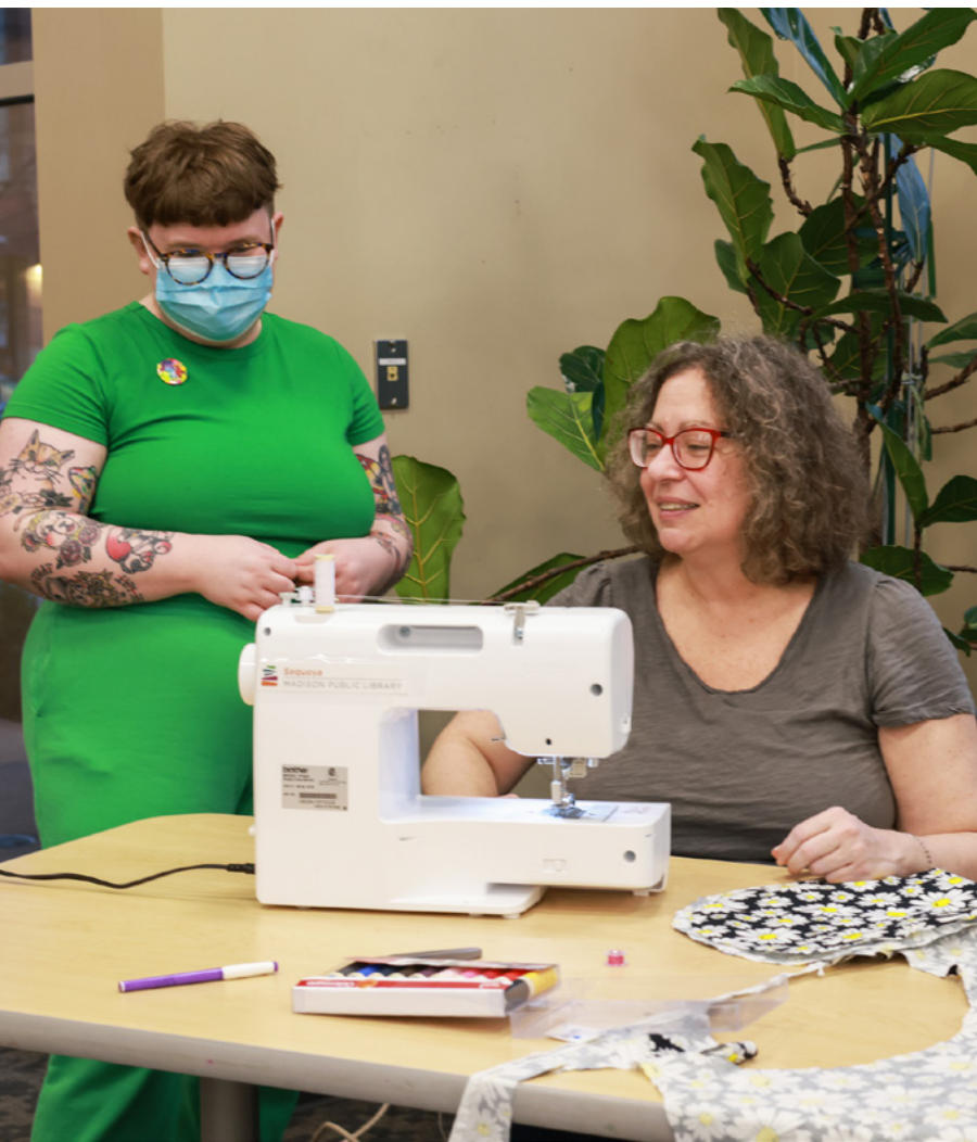
Sewing class at Sequoya Library