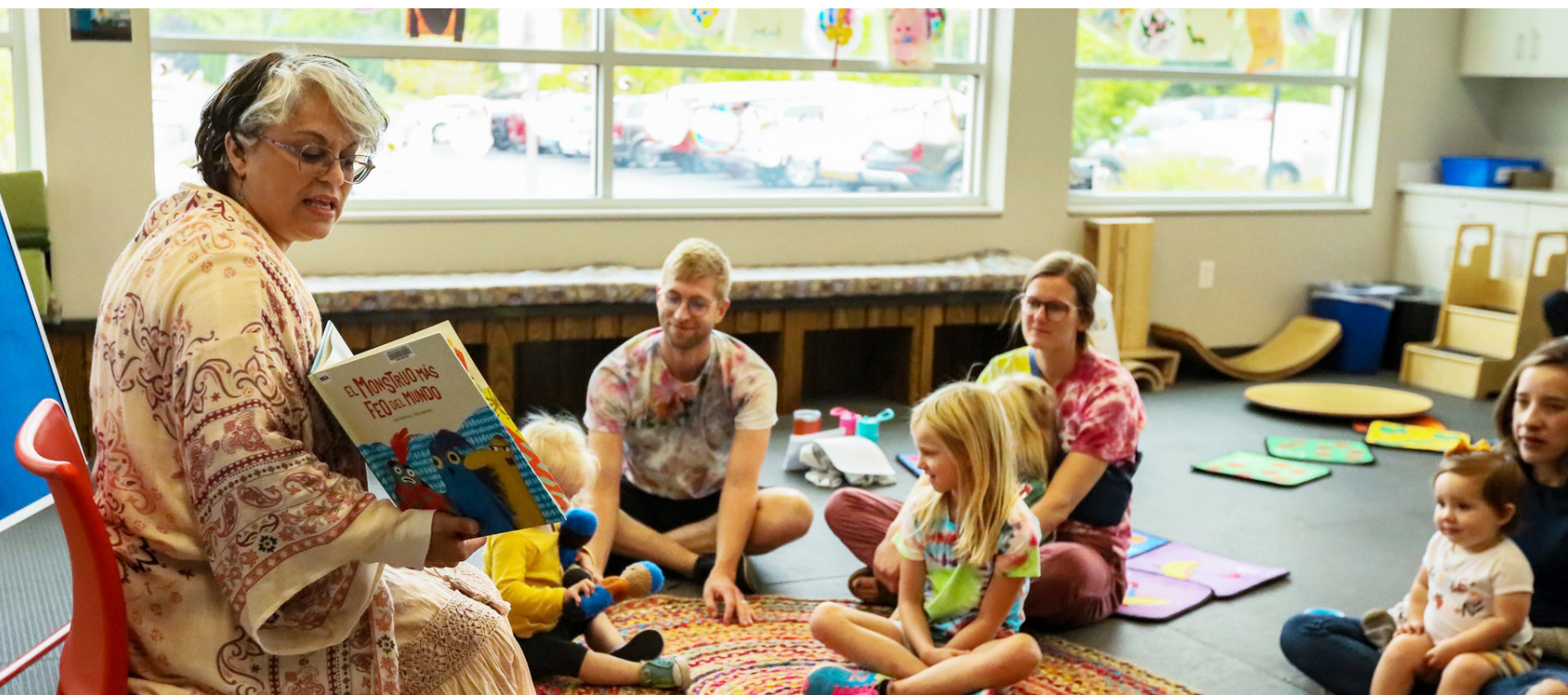
Mini Feria de Libros at Pinney Library