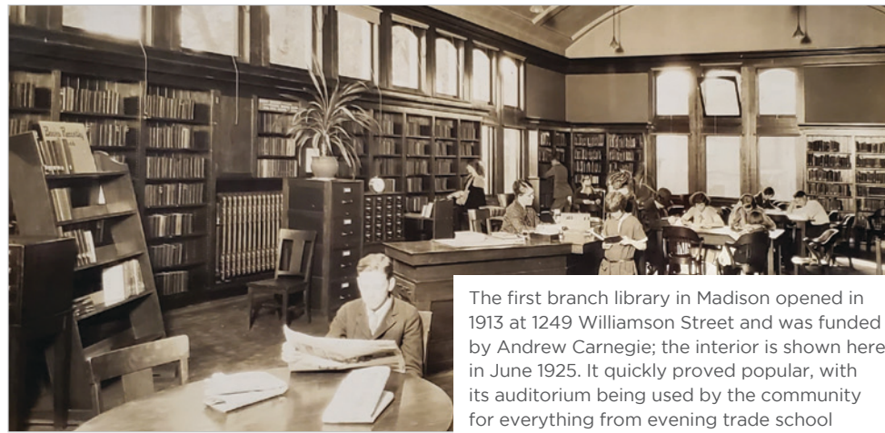
The first branch library in Madison opened in 1913 at 1249 Williamson Street and was funded by Andrew Carnegie; the interior is shown here in June 1925. It quickly proved popular, with its auditorium being used by the community for everything from evening trade school education to gymnastics. After relocation in 1958, this library was renamed Hawthorne through a contest. Today, there are nine locations, with a 10th library — the Imagination Center at Reindahl Park — slated to open in 2026, and the Dream Bus mobile library delivering materials across the city.

Watch for announcements at the official start to the festivities next month at madpl.org .