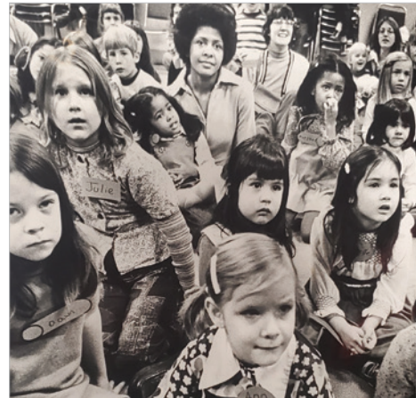
Although play toys in branch locations had been in place for decades, the mid-1970s saw the advent of Madison Public Library's first circulating toy library designed for young children. Pictured are families at a Valentine's Day storytime at Central Library in 1976. Today, families can enjoy modern play areas at all nine libraries and check out adaptive toys through the Library of Things.