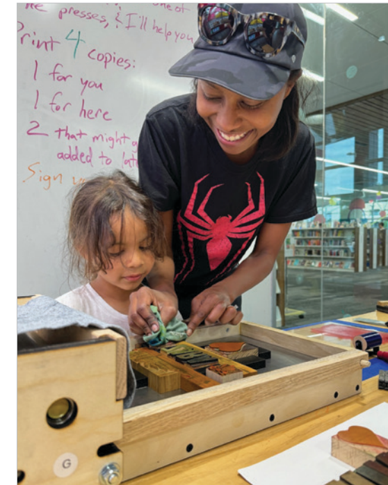
Annual fund gifts support programming at the libraries.

Your past gifts made it possible for the foundation to provide nearly $200,000 toward the following projects and resources in 2024: