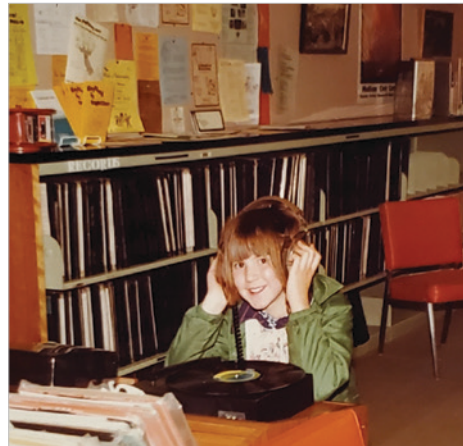
The library saw increasing interest and investment in other collections, including music, from the 1940s on. Pictured is a child listening to a record at Central Library in the mid-1970s. Today, you can check out vinyl at Central and Monroe Street libraries, or request items through LINKcat.