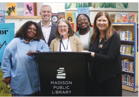
Library, foundation, city, and state leaders took part in a press conference to announce the Imagination Center's Flexible Facilities grant from the Department of Administration

In October, the Wisconsin Department of Administration committed $4.25 million to the City of Madison for the Imagination Center through the Flexible Facilities Program (FFP). Funded through the U.S. Department of Treasury Capital Projects Fund as part of